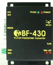
BF-430 TCP/IP CONVERTER (BF-431 for RS-422 CONVERTER)

RS232 / 485 to TCP / IP Converter Module